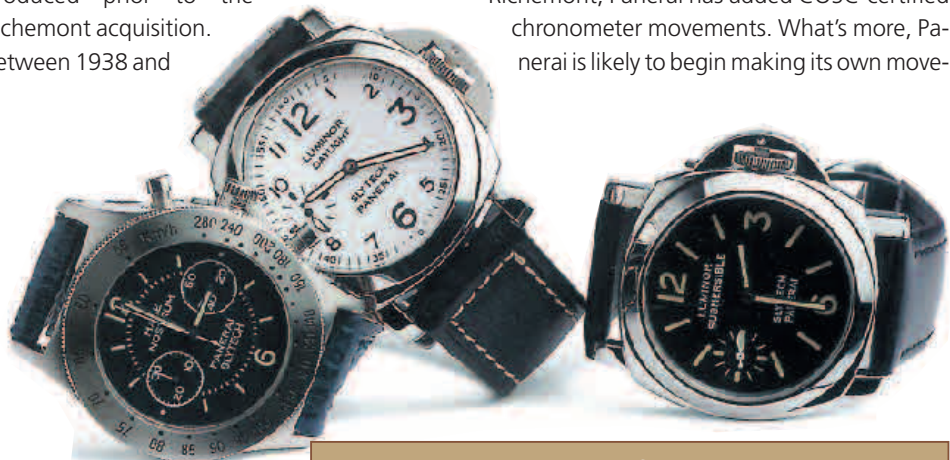
Three watches from the Sly Tech series made exclusively for actor Sylvester Stallone.

Panerai fans cite the brand's exclusivity as one of the most appealing things about it. Rarity has been a feature of the brand from the start. Amazingly few Panerai watches were produced prior to the Richemont acquisition. Between 1938 and