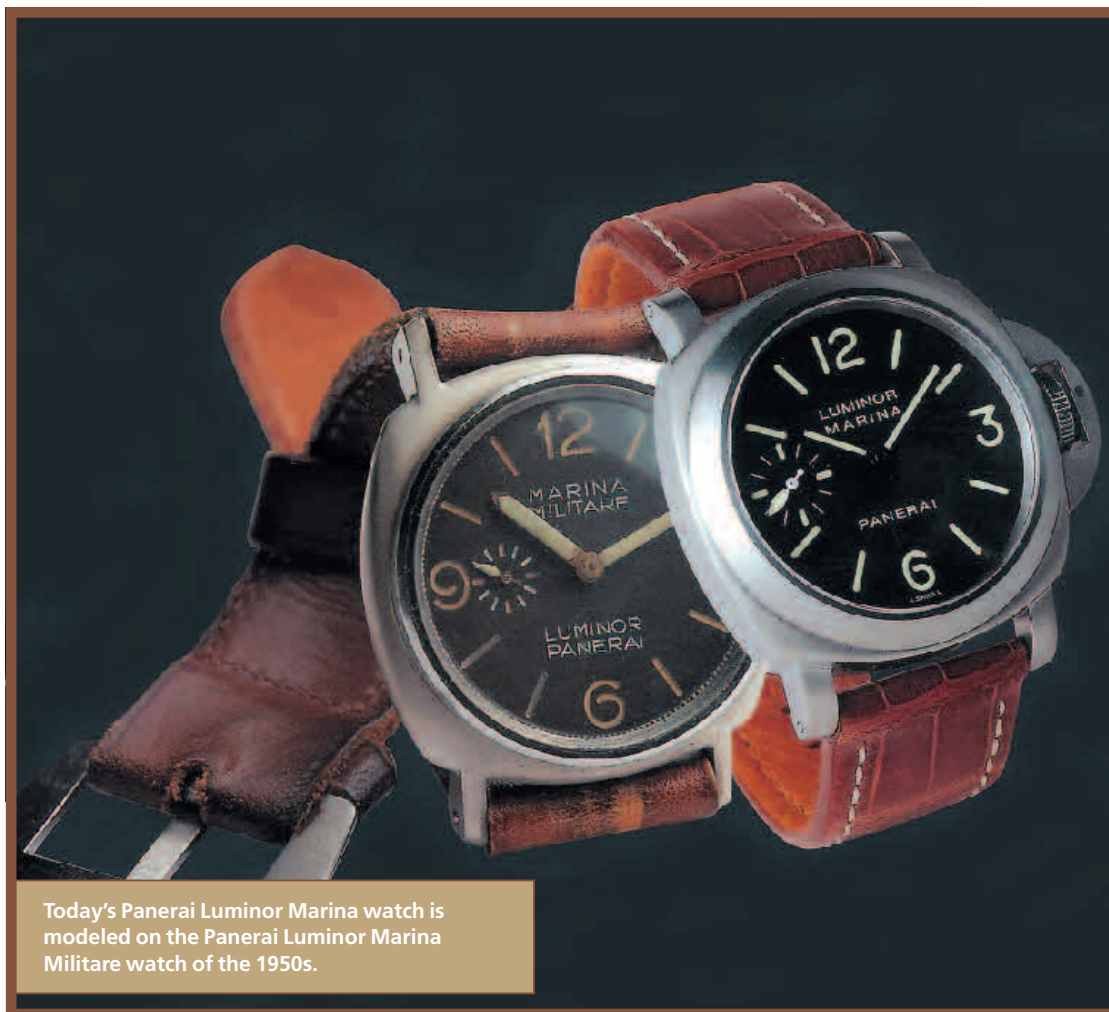
Today's Panerai Luminor Marina watch is modeled on the Panerai Luminor Marina Militare watch of the 1950s.