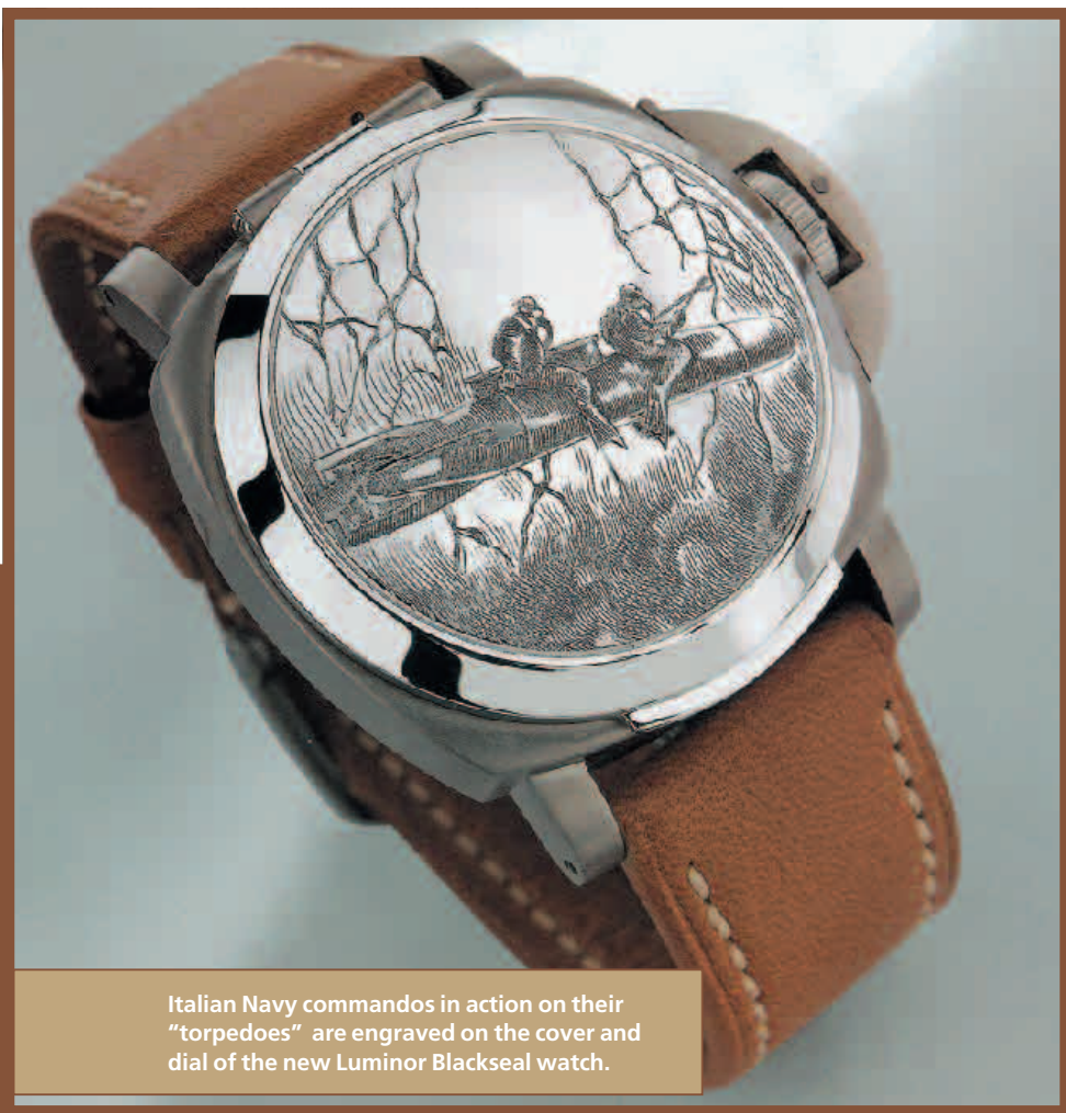
Italian Navy commandos in action on their "torpedoes" are engraved on the cover and dial of the new Luminor Blackseal watch.

crown, forcing it to fit more snugly within the protective seals inside the case. The added pressure made the watch water-resistant to 200 meters (650 feet), deeper than any commando could go. When the commando needed to wind the watch or reset the time, he simply released the lever, had access to the crown, then screwed it back in and closed the lever. Voila': problem solved.