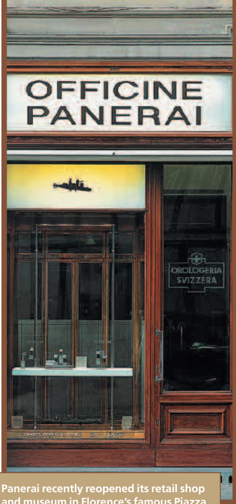
Panerai recently reopened its retail shop and museum in Florence's famous Piazza San Giovanni. Its Orologeria Svizzera business has been a prominent retailer of Swiss watches for more than a century.

ments in the new six-story production facility it recently opened in Neuchatel, Switzerland.