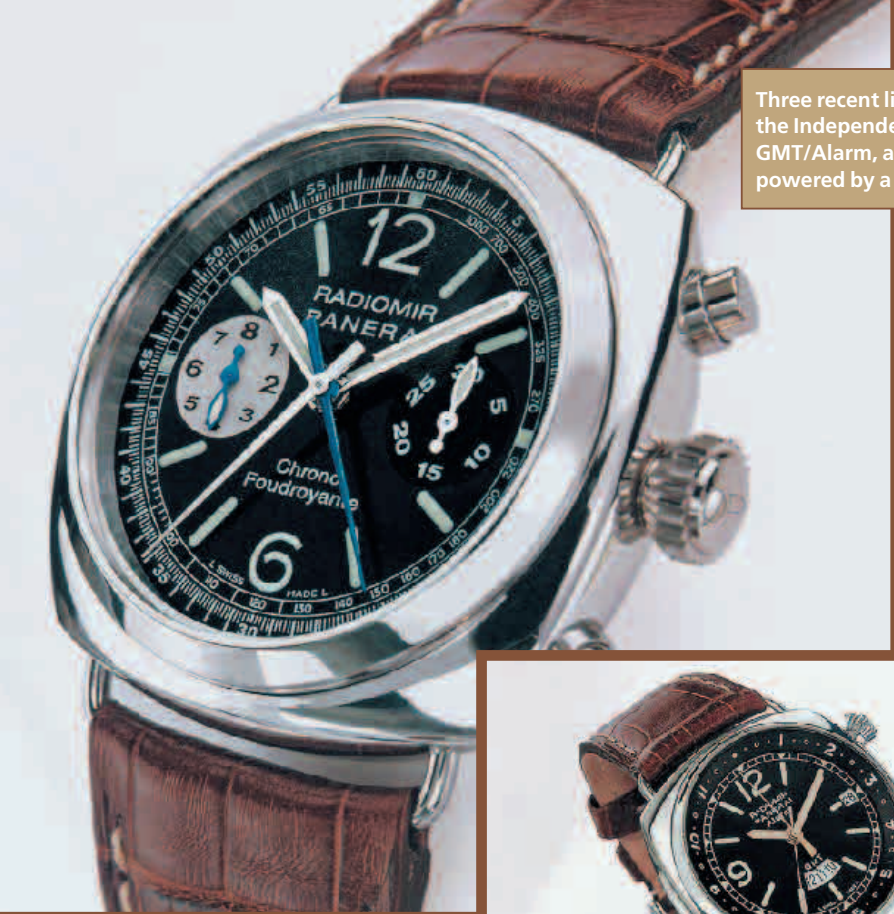
Three recent limited-edition Radiomir watches: the Independent in 18k white gold, the steel GMT/Alarm, and the steel Chrono Foudroyante powered by a Jaquet caliber 8952.